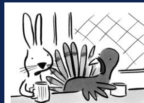
Take the groundhog - now that's a sweet gig.”